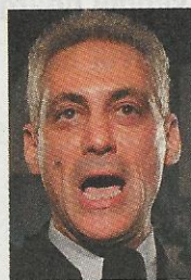
Mayor Rahm Emanuel entered office with national aspirations.

“I’m not running for higher office—ever.”