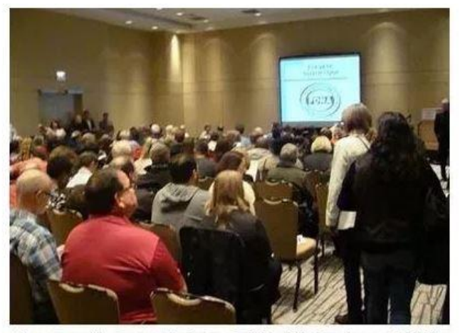
It was standing room only for the 2nd Ward Illumination on 9/14/14.